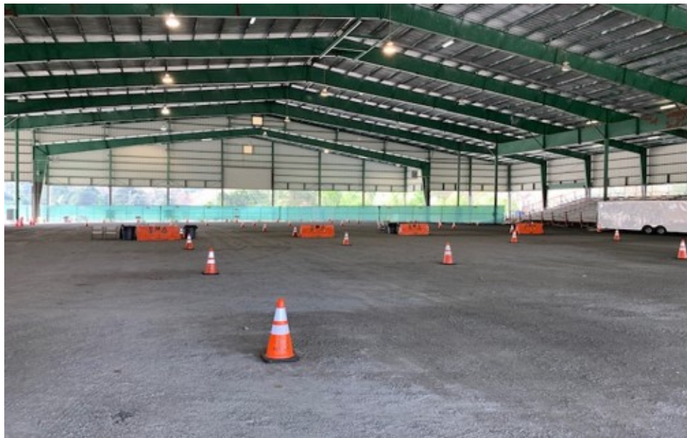
Figure 1. A semi-indoor horse arena can serve as a drive-through specimen collection clinic site.