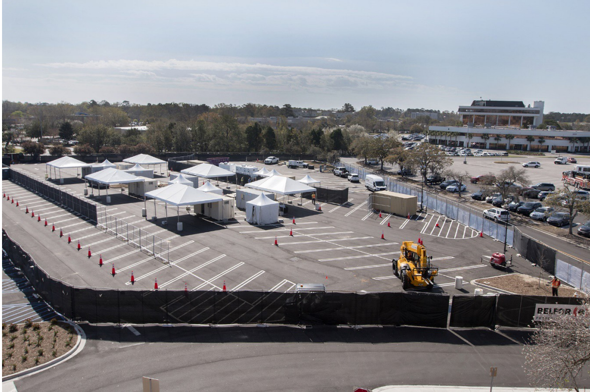
Figure 3. An aerial view of the Medical University of South Carolina's drive-through respiratory specimen collection site.